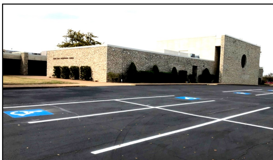
Freshly painted and striped parking lot.