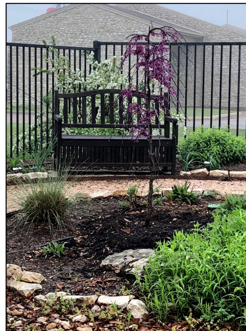
Newest addition to the meditation garden, a Ruby Falls Weeping Redbud tree.

Take a moment the next time you are at the church to sit on a bench, relax and enjoy God's generous gifts.